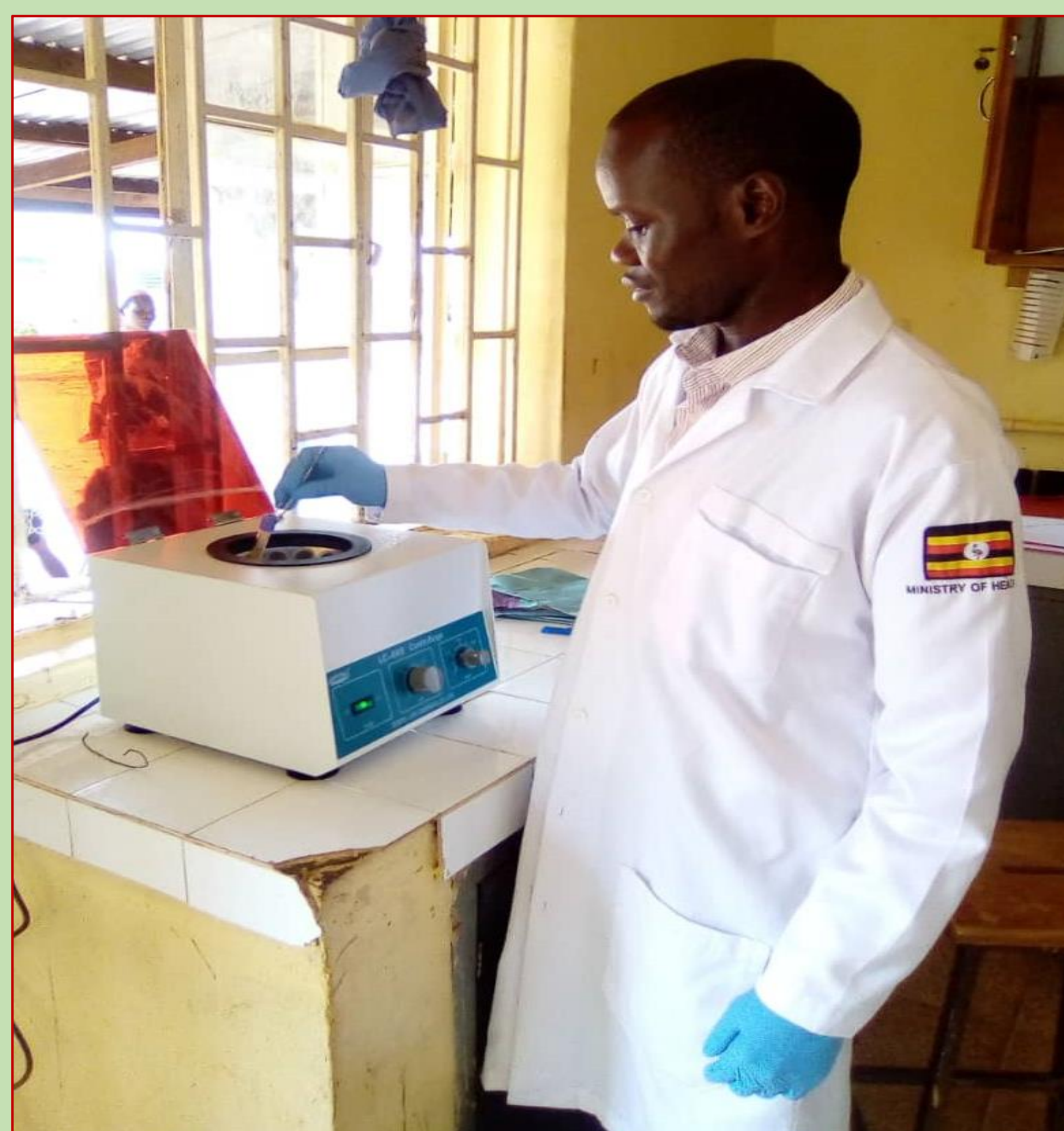
Lab staff placing Viral load samples in the centrifuge at Kibuku HC IV, Kibuku.