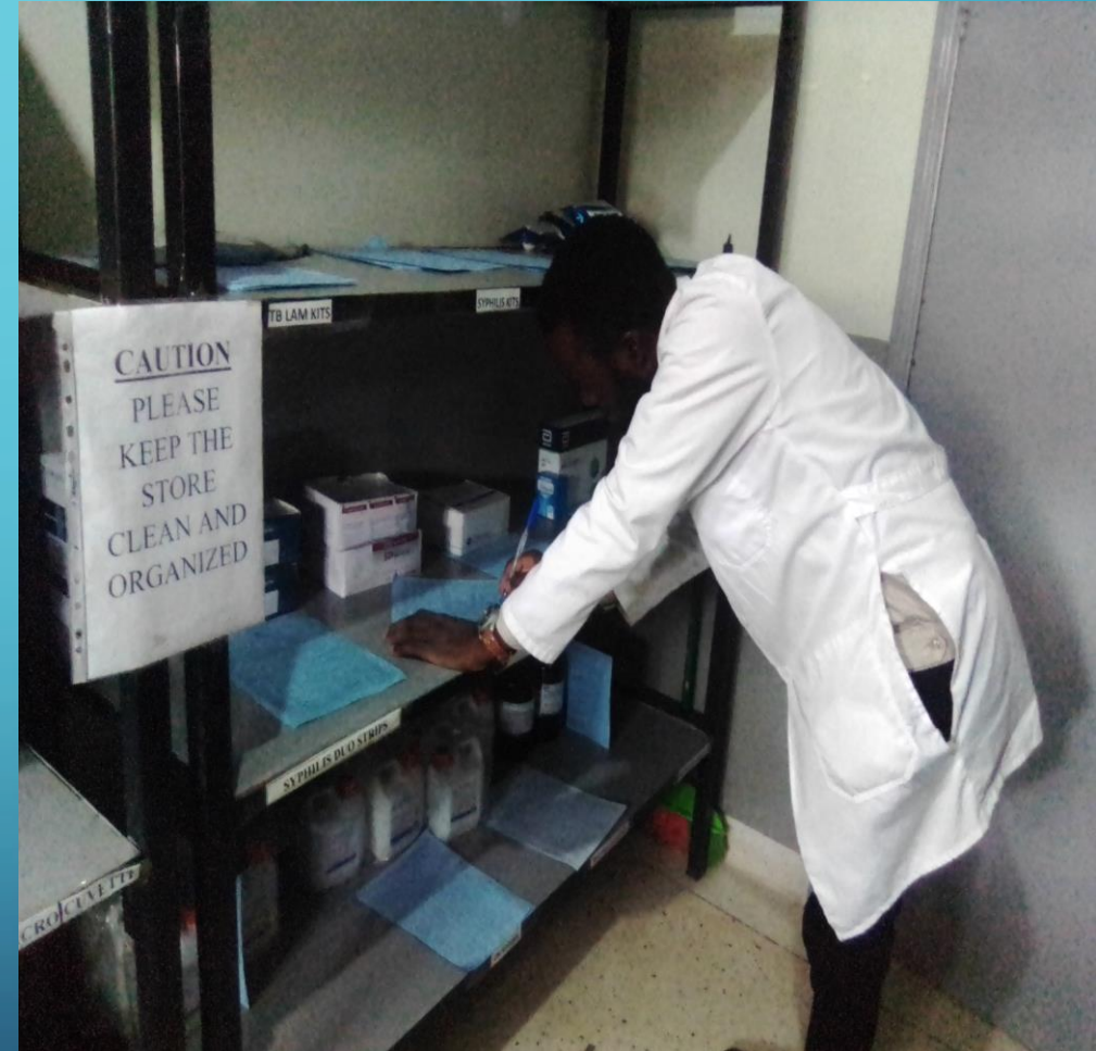
Figure 1: Logistic officer monitoring & updating stock cards for lab items